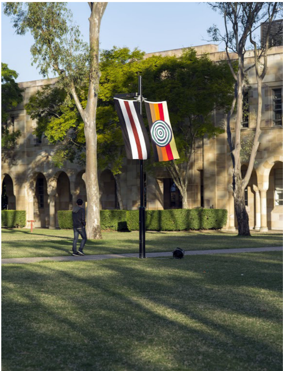
ABOVE: ARCHIE MOORE Courting Blakness , 2014 Installation Shot